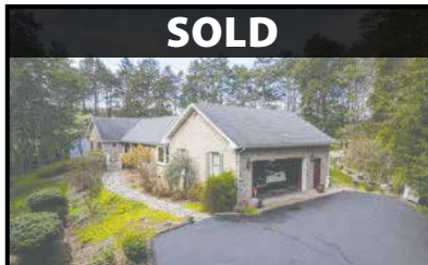
30 Edgewood Drive Lexington