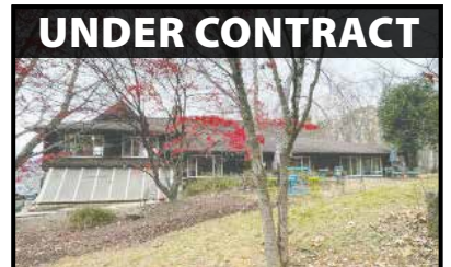
494 Smokey Row Road